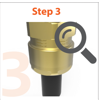
The backnut should be level with the marking guide corresponding to its diameter – this can be visually inspected and adjusted as necessary

Note: The cable gland installation instructions have a printed cable OD measure for if the cable OD is not known