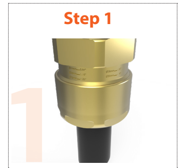
Follow cable gland installation instructions until final stage – tightening of rear seal

The gland is permanently marked with various lines/numbers indicating the correct tightening level related to the cable diameter. Following the relevant cable gland Installation Instructions, the back seal should be tightened until a seal is formed on the cable outer sheath and then tightened one further turn.